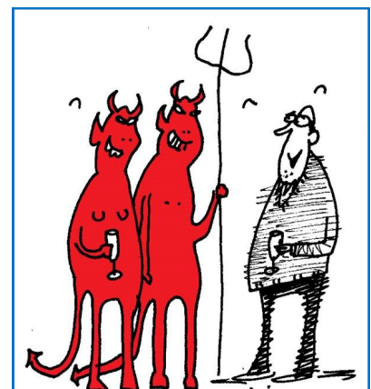
"It's so nice to meet the neighbours - where are you from?."

Take a 'selfie' of yourself with a neighbour at your front door and send it to info@wsms.org.uk and we will try to start a viral campaign.