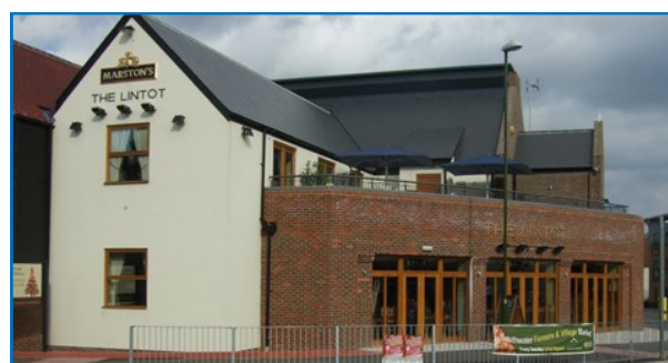
<--- Lintot Pub Southwater